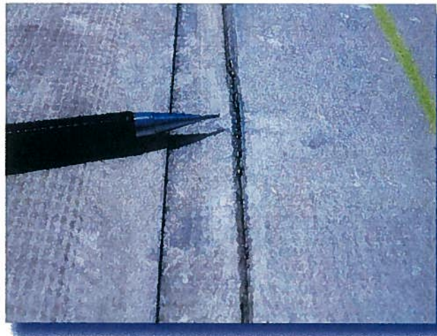
Split of TPO membrane at field seam.